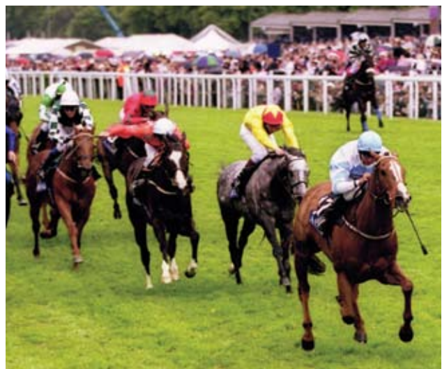
Lafi, backed as if defeat was out of the question, cruises to victory at Royal Ascot.

Henry Rix profit comparison for last fifteen years: 1 st January 1996 – 31 st December 2010, on annual £20,000 investment.